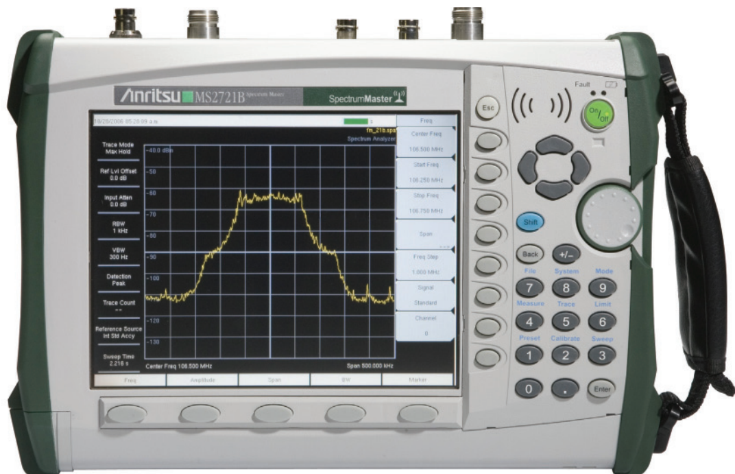
Spectrum Master™ MS2721B Spectrum Analyzer Handheld Size: 315 x 211 x 77 mm (12.4 x 8.3 x 3.0 in), Lightweight: 3.1 kg (6.9 lbs)